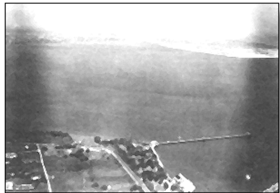
An aerial view of Ballast Point Park, Tampa Yacht Club to the south, Tampa Gun Club to the north, and Davis Islands still under construction across the bay. The bicycle race track, no longer in use, can be seen across from the park and the Gun Club.