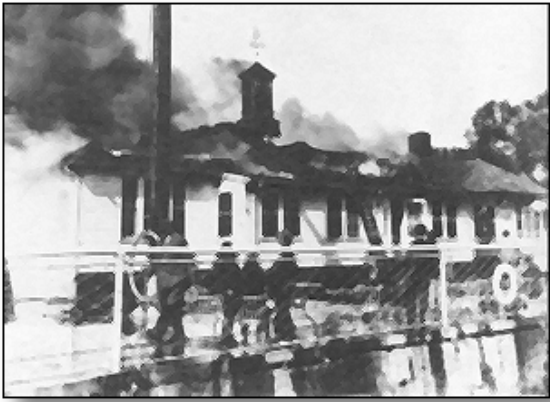
The fire that destroyed the Tampa Yacht Club in 1938. Ballast Point Park is to the right of the picture.