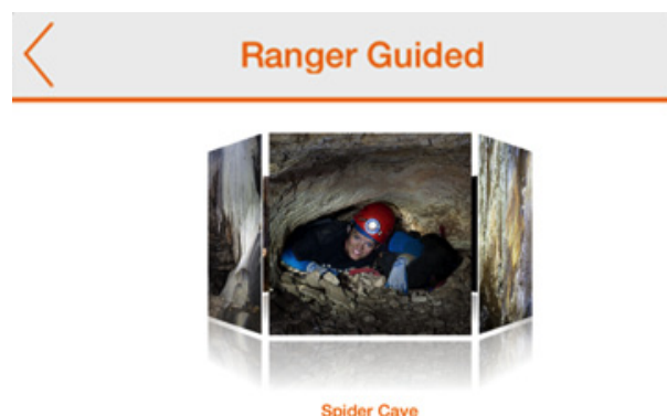
Figure 1. Screenshot of the iCaverns app user interface.

This purpose provides complex management challenges: preserving a resource while making it available for recreation. Perhaps the authors of this law gleaned from the wisdom of great naturalists like John Muir, Enos Mills, and Freeman Tilden to develop this seemingly paradoxical purpose. The work and accomplishments of these early conservationists illustrate the idea that one's