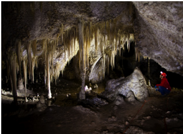
Figure 4. Underground landscape in Lower Cave.

The iCaverns’ photographer, Dianne Joop, worked within the boundaries of two photographic concepts, one, taking photographs to support the video component and two, capturing photographs to convey a story. Joop composed her shots to give users a sense of being in the caverns, traveling through passages, and making the discovery of the beauty that waits around the corner.