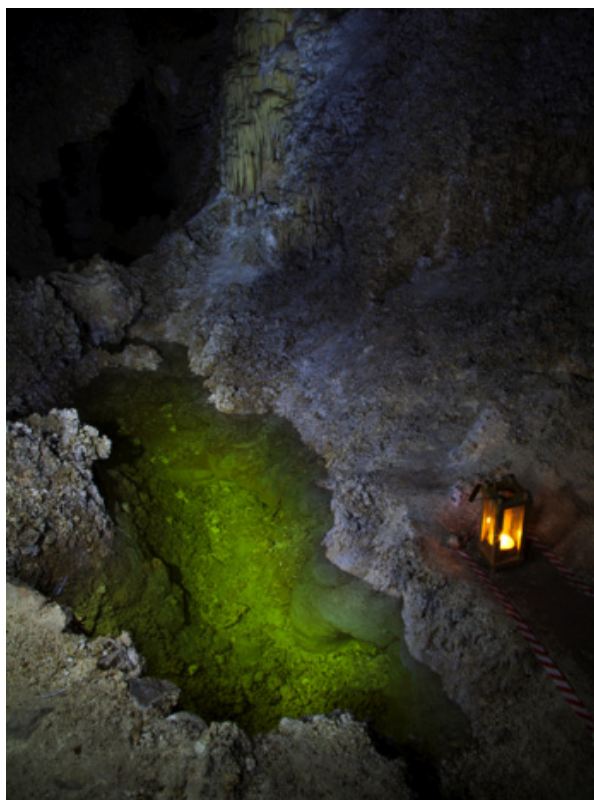
Figure 2. iCaverns app photo sample of the Left Hand Tunnel tour.

Indeed many of the cave or karst focused attractions have both personal and nonpersonal interpretive programs. Unfortunately, some of these programs have been responsible for passing forward misinformation about cave and/or karst resources (Kastning and Kastning,