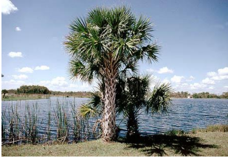
Figure 2: Cabbage palms are so drought and fire-resistant due to their unique spine-like structures that collect leaf debris to insulate from wildfires ( Florida eco travel guide , n.d.)

Geographically speaking the entire state of Florida is defined by its water flow. The Kissimmee-Okeechobee-Everglades (KOE) watershed is the movement and transportation of water from Orlando down to the Everglades, where it nurtures the state's pride and joy: Everglades National Park. Although nowadays, the natural flow is not as strong due to flood prevention measures, rainfall amount does affect the river discharge ( SOFIA , n.d.). Rainfall quantities also have societal implications, in addition to environmental ones. According to the South Florida Water Management District, more than 90 percent of people in northeast and east-central Florida obtain their water from the aquifer ( SJRWMD , n.d.). The Floridian Aquifer extends beneath much of Florida in its porous limestone base. When it rains, a process called percolation occurs where the rainwater will drain through the limestone, recharging the aquifer beneath. Fluctuating rainfall amount can lead to drought, which affects fire occurrence and water availability. When drought occurs, it affects lifestyle choice such as water usage for lawns or showers. Also it can have more