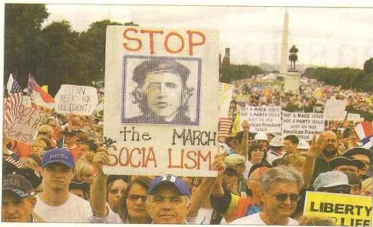
Demonstrators protest on Capitol Hill on Saturday against President Barack Obama. Protesters expressed anger at health care legislation and support for low taxes and smaller government.