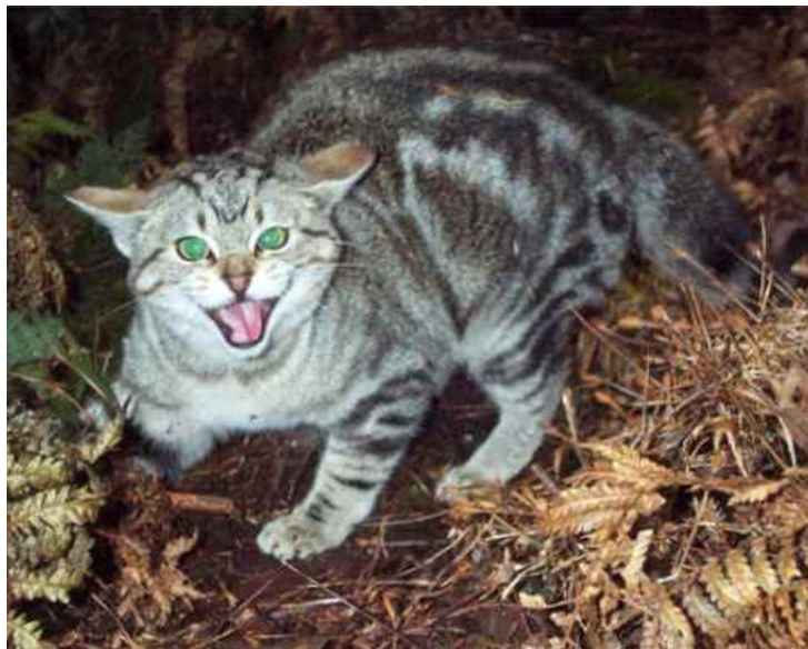
Figure 1: Free-Roaming Tabby Cat

In this project, we attempt to estimate the weekly number of cats that must be spayed/neutered in order to prevent the population from increasing.