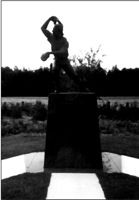
Al Lopez Monument - Al Lopez Park, Tampa, Fla.

In his autobiography, Veeck-As in Wreck , Bill Veeck declared, "If Al Lopez has a weakness as a manager, and I said if, it is that he is too decent ... Al was completely relaxed. In that cool, calm way of his he squeezed every possible drop of talent out of his team" 1