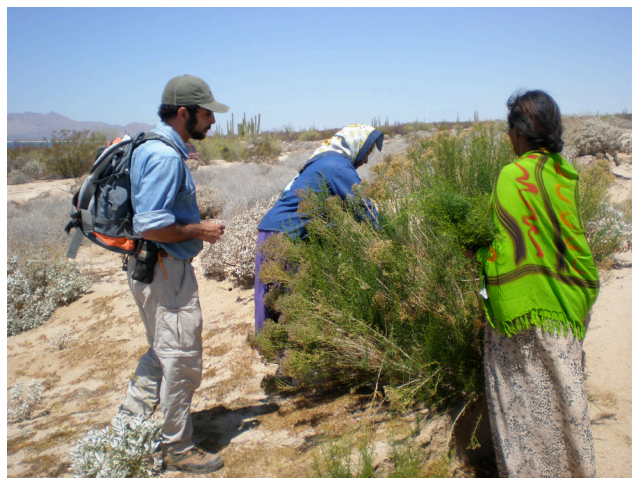
FIGURE 1. Ambrosia salsola , called by the Seri caasol cacat . A tea made with the stem is used to heal swollen parts of the body and respiratory ailments. The tea can also be used as a topical solution against skin infections and as a wound cleanser. In recent years, Seri women use A. salsola as raw material to create medicinal soaps which they sell to outsiders.

The association between aposematic coloration and toxicity is noticeable, yet poorly described to the present date. Nonetheless, it is clear that the link between toxicity and aposematism results from the interactions between complementary morphological and physiological processes. Therefore, one can