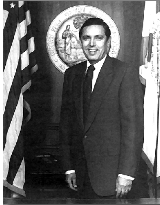
GOV. BOB MARTINEZ

Many more settlers followed from Asturias and other parts of northern Spain. Spanish names were given to important landmarks including the St. Johns River and other waterways. The archaic Spanish-Asturian dialect of the time would pronounce the name John (Juan) as "Xuan" pronounced "shoe-ah-nee" and the Little John (River) was "Xuani", pronounced ""shoe-ah-nee" and some say that is probably why we have what is known today as the Suwannee River. One prominent Asturian name is the town of Oviedo, northeast of Orlando, named after the capital of Asturias, but the town's people today pronounce it "Oh-vee-dah" rather than