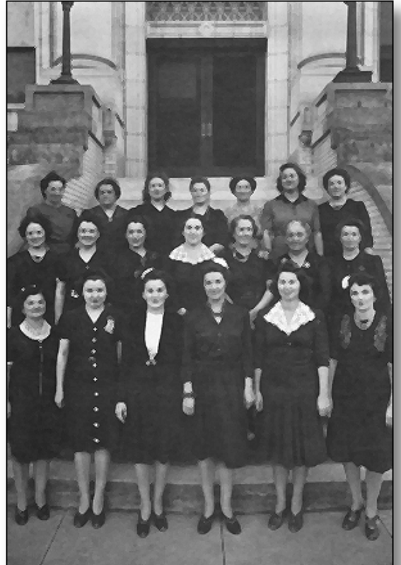
CENTRO ASTURIANO LADIES

That rugged Cantabrian coast and the unique mixture of bloodlines produced intrepid leaders, excellent navigators and cartographers that were used in the early explorations and colonization of the New World. Among many of these was Pedro Menendez of the town of Aviles. The King