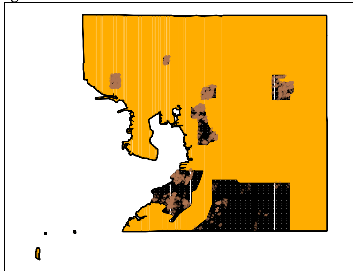
Figure B2 – Benchmark Area Business Establishments

In addition to employment and wage data, the EQUI database also classifies businesses by their NAICS code. Table B1 is the inventory of business establishments within the CDBG benchmark area by NAICS. 2 NAICS is the acronym for North American Industrial Classification System, which replaced the Standard Industrial Classification (SIC) code developed by the government to classify industries. NAICS codes range in detail from 2-digit sectors (such as 52 - Finance and Insurance) to 6-digit industries (such as 524210 - Insurance Agencies and Brokerages).