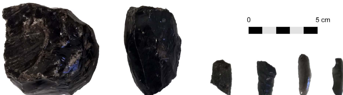
Figure 3: Artifacts from San Leonardo di Cutro, near Crotona, Calabria. Prepared cores (see particularly the second artifact from left for a core partially used to produce blades as those to the right) are frequent in Calabria, unlike Sicily.

The nearly absolute absence of indigenous types merits further consideration. Given the broad range of distribution of Lipari obsidian since the Early Neolithic, it comes to no surprise that areas with different lithic traditions were interested by the exchanges. Yet, no