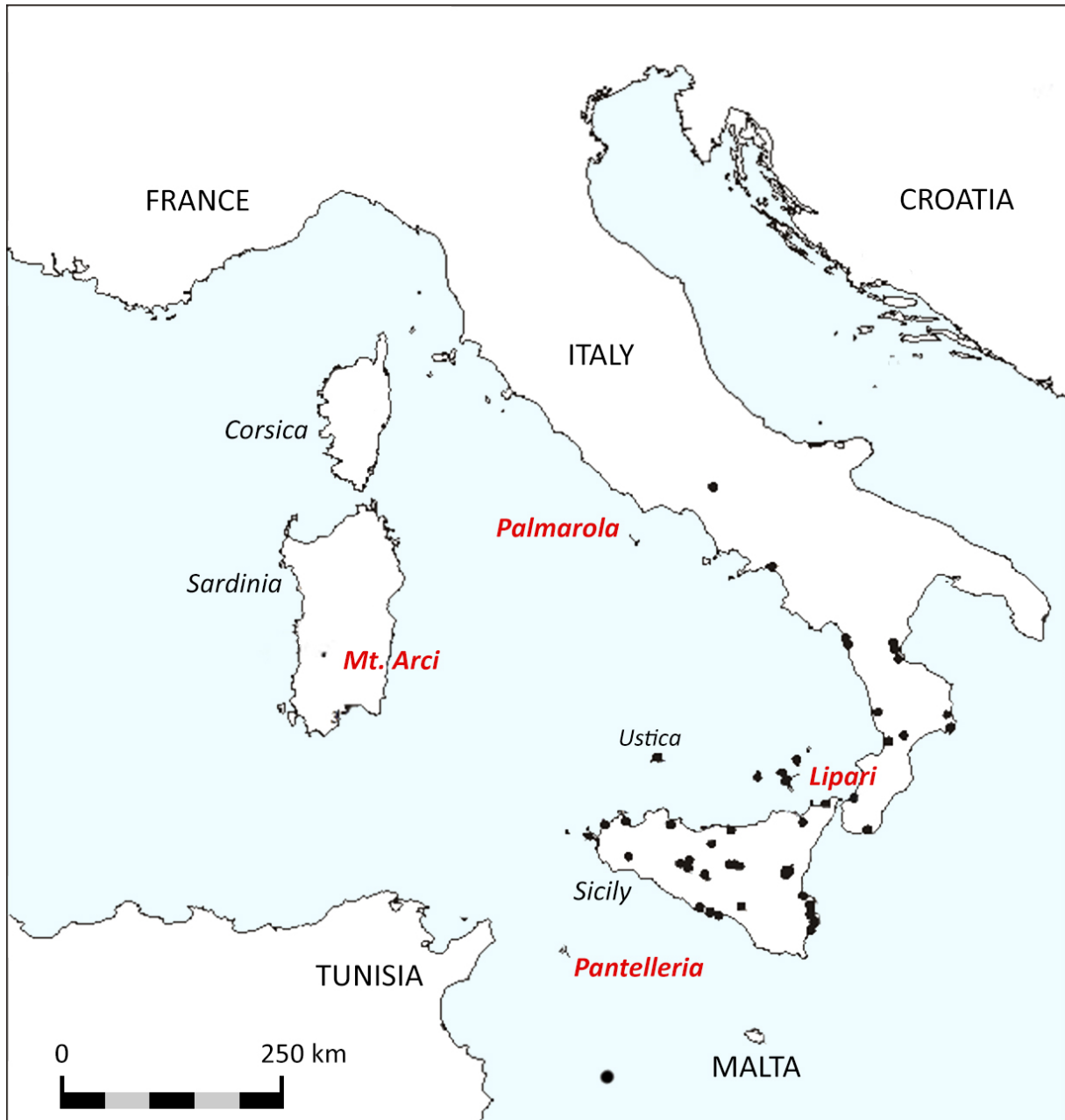
Figure 1: Map of the area being investigated. The four main sources of obsidian in Italy are marked. The sites indicated are those listed in Table 1. Most sites yielded almost exclusively Lipari obsidian, with the exceptions a few coastal sites facing Pantelleria in the western part of Sicily.

sources within the distribution area of Lipari obsidian: Monte Arci in Sardinia, tiny Palmarola in Campania, and Pantelleria, a small but inhabited island located south of Sicily. The obsidian from Lipari can be black or grey, with or without phenocrysts, and varying in translucency; Palmarola obsidian is similar in color but mostly opaque and without phenocrysts. Pantelleria obsidian is dark green and mostly opaque. There also are differences in the size of the natural blocks available, and in the physical properties which affect percussion size and success, and the brittleness of the tools produced. The distribution of Lipari obsidian encompasses a remarkably large area, which is centered on the Italian peninsula, with large amounts found in southern Italy and Sicily (Figure 1, Table 1).