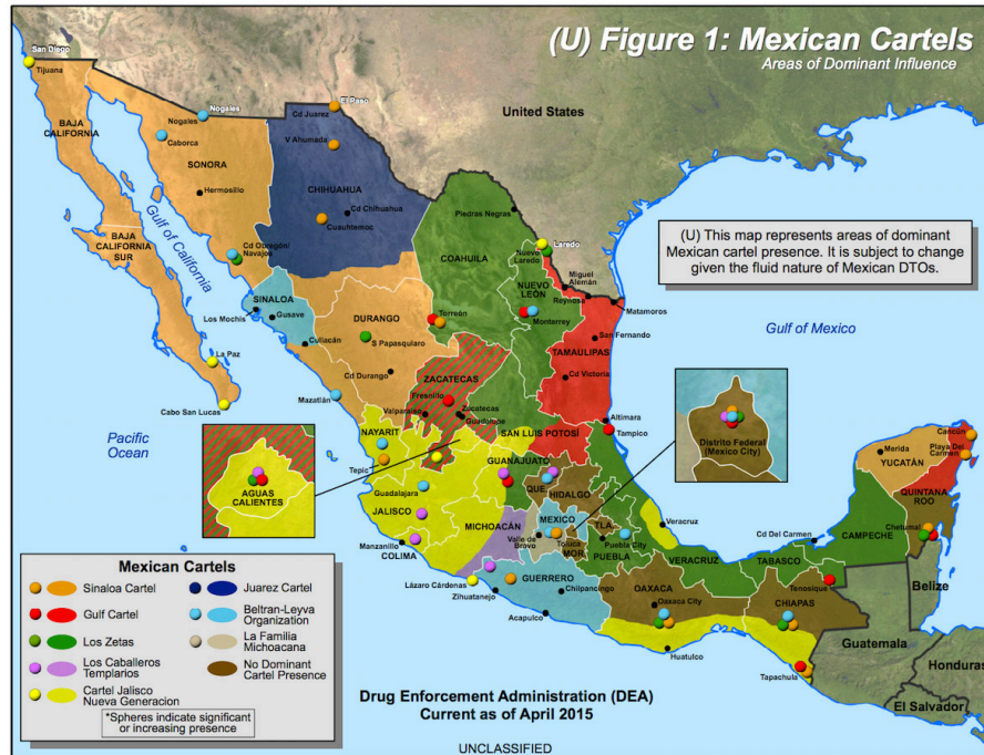
Figure 1. Mexican Cartel Areas of Dominant Influence According to DEA. This map shows areas of cartel dominant influence according to DEA as of 2015.

Source: United States Drug Enforcement Administration (2015) and Beittel, June S. "Mexico: Organized Crime and Drug Trafficking Organizations." Congressional Research Services, April 25, 2017. https://fas.org/sgp/crs/row/R41576.pdf .