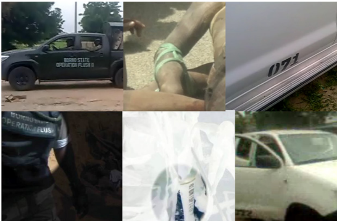
Figure 4. Some colors inverted using VLC Player, for enhancement purposes only. Graphic produced by author.

killed them, and threw their corpses in a river. Due to the clear geographic landmarks visible in the video (prison and bridge), it was possible to confirm the exact locations and reconstruct the event.