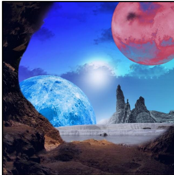
Figure 3. A parallel or fantasy universe as an analogy for the null hypothesis in hypothesis testing.

One of the most challenging concepts in introductory statistics is the P -value. Many instructors have been disappointed to find that at the conclusion of the course, after students have successfully calculated dozens of hypothesis tests, they still cannot explain what a P -value is. We have constructed an analogy around the idea of visiting a science fiction world. Figure 3 shows one visualization, but in class we might select screenshots from a popular science fiction movie such as Avatar .